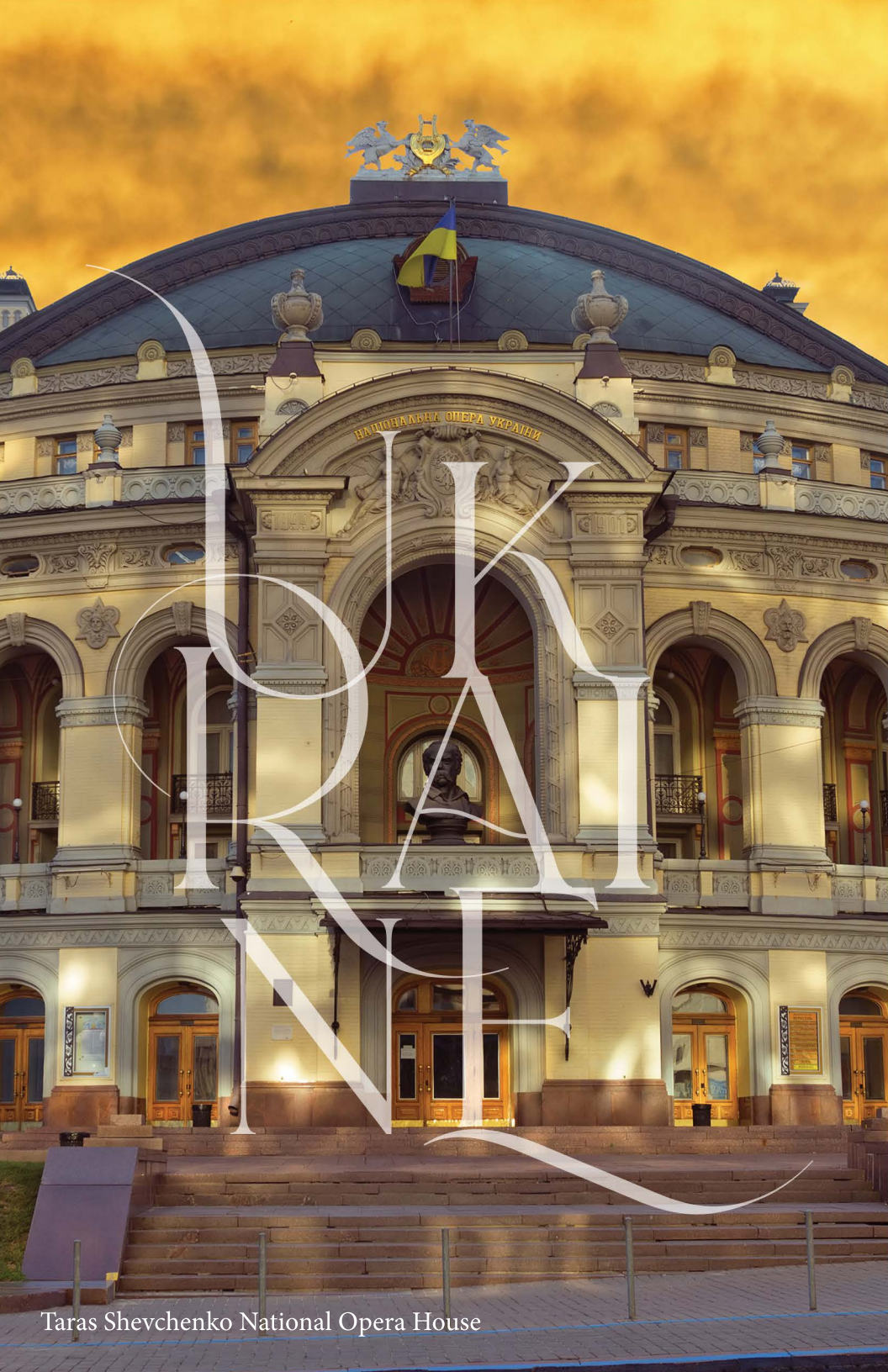
Taras Shevchenko National Opera House