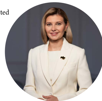
Olena Zelenska First Lady of Ukraine

Thank you for standing in solidarity with the Ukrainian people amid our continued struggle for democracy, dignity, and the future.